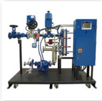
1. Compact standard heat transfer packages

We offer configured solutions, with flexible modularity to suit various systems, helping to reduce capital costs. Spirax Sarco heat recovery solutions enable users to recover usable energy from various sources; boiler blowdown, flash steam, and more. These packages provide improved efficiencies, and subsequently financial benefits such as attractive return on investment, and short payback periods.