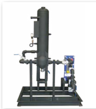
3. Heat recovery packages