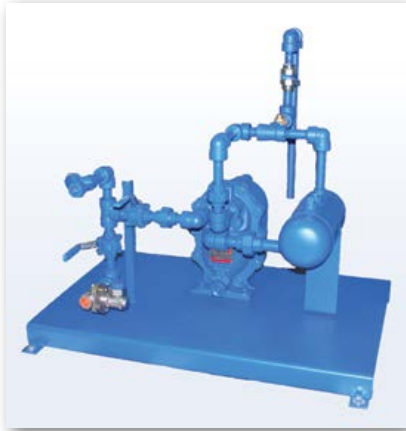
6. Pump and pump trap packaged solutions for condensate management

Condensate pumps with steam trap and / or receiver for the effective removal and return of condensate.