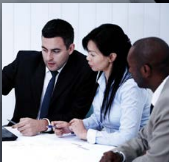
Customer focused solutions partner