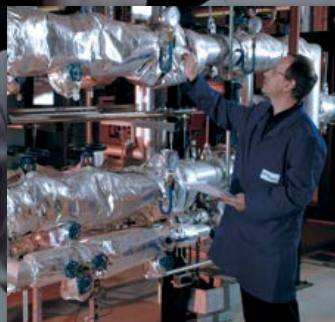
Ready assembled control systems