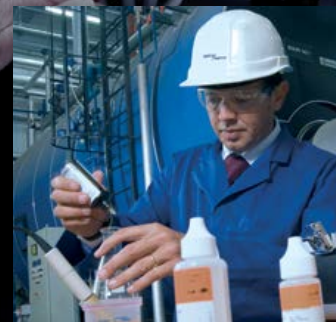
Steam condition monitoring