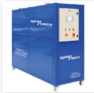
2. Clean steam generators