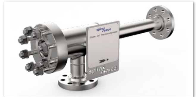
5. Steam Jet Thermocompressor