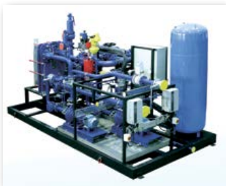
2. Custom heat transfer solutions