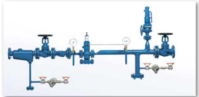
7. Pressure reducing station

Pre-assembled stations including matched products to condition the fluid prior to controlling its temperature, pressure etc., or measuring its flowrate. Includes all necessary downstream products.